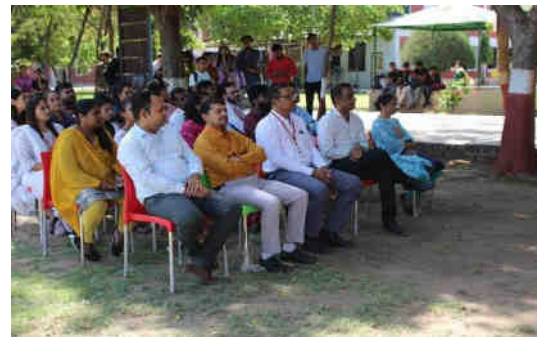
Honourable HOD's and Faculties (Dean and Principal) Rai University