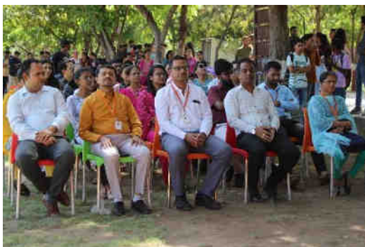
Honourable HOD's and Faculties