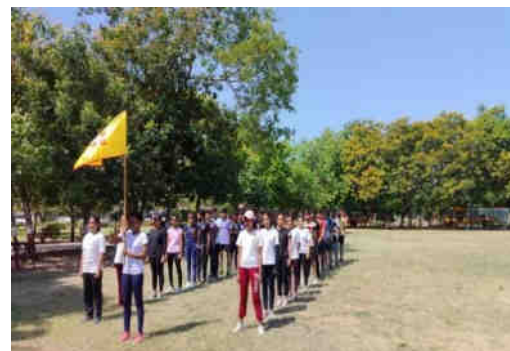
Flag March by Partakers